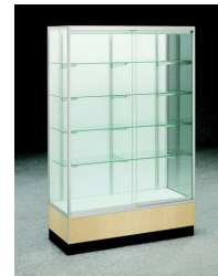
Upright Display 72"H x 20"D (4) Rows of 12" shelves